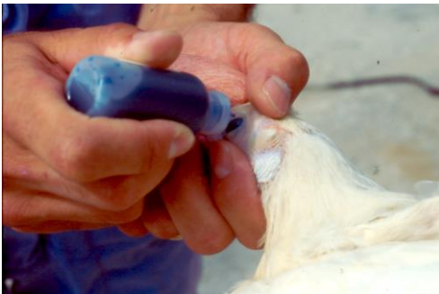
Fig 3: Eye drop application of ILT vaccine.