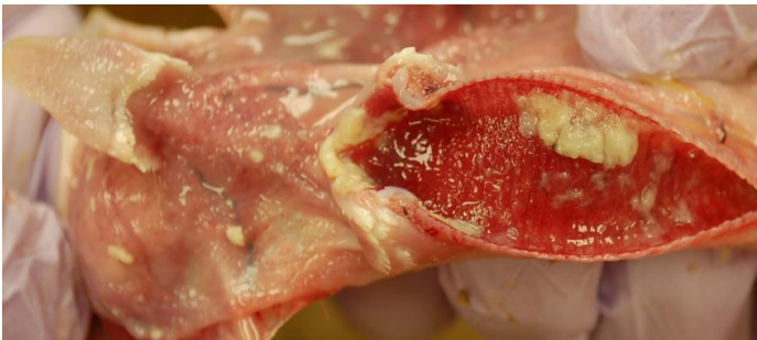
Fig 2: ILT. There is fibrinous exudate in the laryngeal opening and also in the tracheal lumen. The tracheal mucosa is hyperemic. A few small plaques of fibrinous exudate are also on the oral and esophageal mucosa.